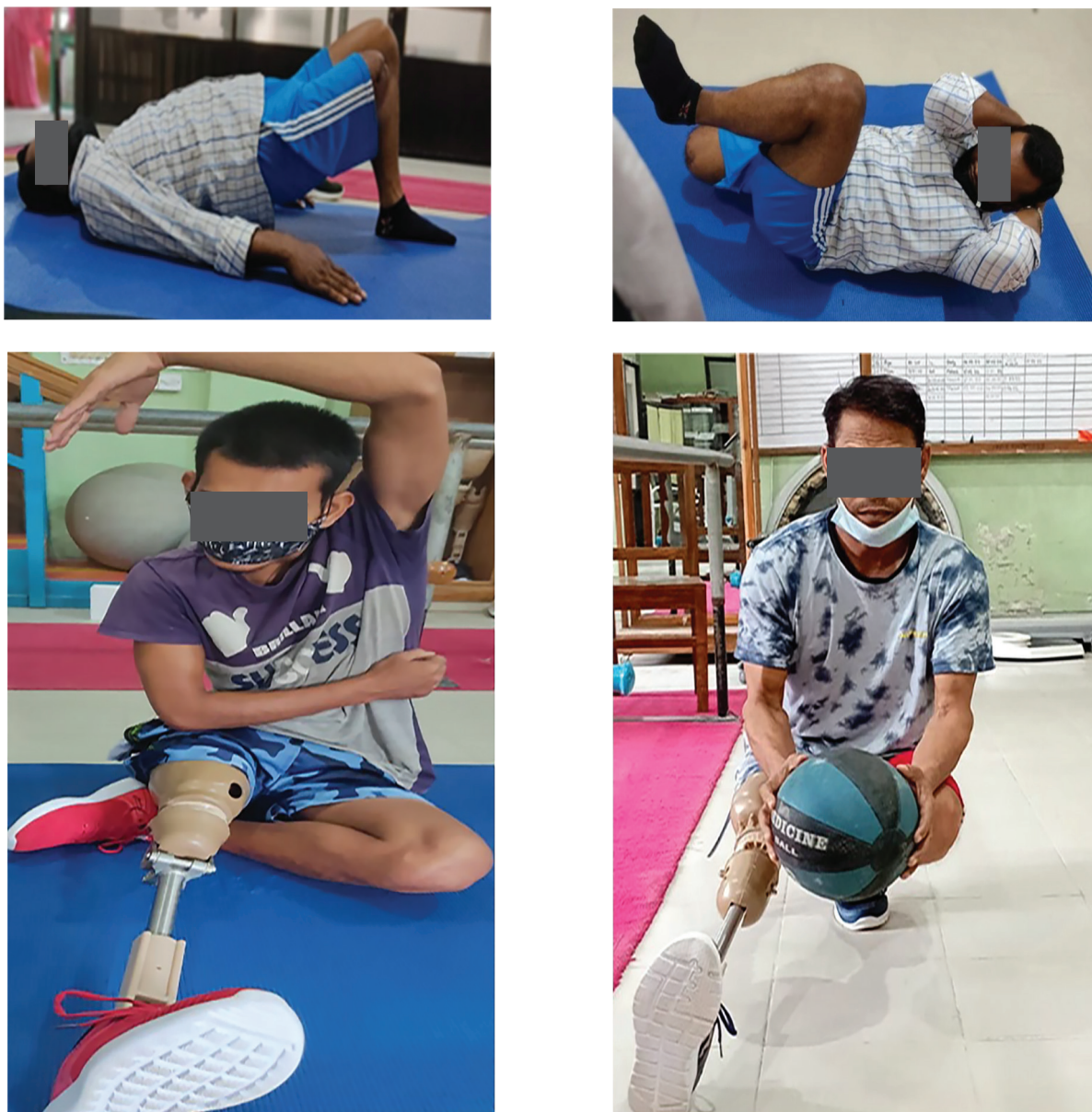
Figure 2 Pilate's exercise of amputee patients in different positions