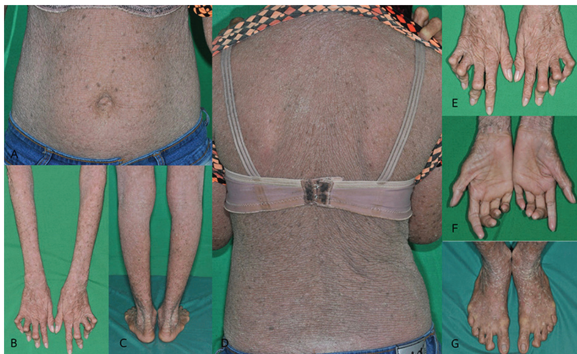
Figure 1 Epidermolytic ichthyosis. (A–D) Widespread scaly brownish hyperkeratosis and multiple lentigines are noted. (E–G) Contraction deformity affected fingers and toes.

A 39-year-old woman presented with generalized erythroderma and desquamation since birth. Later in life, she developed generalized marked hyperkeratosis without palmoplantar keratoderma. The patient and her parents had no history of skin blistering at birth. The affected skin was thick and darkened, and accentuated creases had formed over time. She was unable to fully extend her fingers and toes. To her knowledge, she had no family history of similar skin conditions. Physical examination revealed generalized scaly hyperkeratotic plaques over the face, trunk, and extremities, with skin crease accentuation over the joints and body folds. There were no blisters, erosion, or ectropion/eclabium on the periorificial skin.