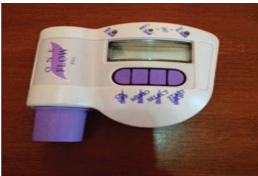
Figure 2 Spirometer One-Flow™ Forced Vital Capacity Kit

After signing the consent form, each student stood straight, looking forward, with their chins slightly lifted. Standing tends to improve lung function and volume as well as improve the movement of the rib cage and respiratory muscles' function. All measurements were conducted under the same environmental factors, with the same temperature and humidity. This is provided by the spirometer guidelines; as per the recommendations of the American Thoracic Society/European Respiratory Society. 15 The spirometer encompassed four respiratory tests (PEF, FVC, FEV1,