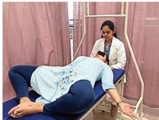
Figure 2 Phase 1A: Lying posture for stretching of the anterior chain muscles