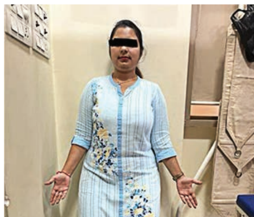
Figure 4 Phase 2: Standing posture incorporating under gravity load