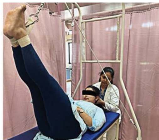
Figure 3 Phase 1B: Lying posture for stretching the posterior chain muscles