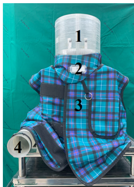
1. eye 2. thyroid (outside the thyroid shield) 3. chest (one is outside the vest and the other is under the vest) 4. wrist

A phantom was used to simulate the density and scatter properties of the human body. The phantom surgeon was a half-body phantom made of poly methyl methacrylate (PMMA) material, which included a 30x30x15 cm slab phantom as a surgeon's trunk and a 7x30 cm pillar phantom as a surgeon's upper extremity. It was dressed with a wrap-around type vest and a thyroid shield (Figure 1). A 30x30x15 cm water phantom was used as a patient's trunk.