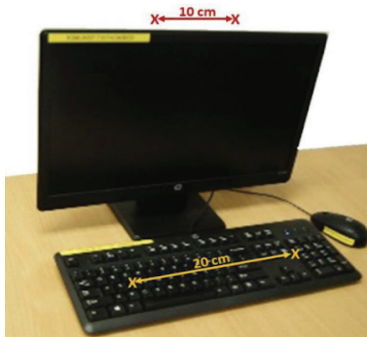
Figure 2 Measurement points for a computer workstation